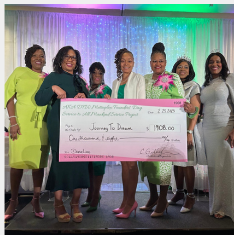
DFW Metroplex Founders' Day of Alpha Kappa Alpha Sorority, Inc. chose JTD for their 2023 "Service to All Mankind" Service Project.