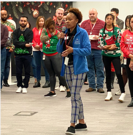
Toyota Motor North America (Plano) did a dollar-for-dollar match donation and raised $10,600 for Journey to Dream.

The Women on Purpose Luncheon & Fashion Show SOLD OUT, and was a huge success. Thank you to all who attended, your contribution to our teens means the world!