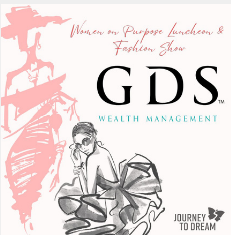
GDS Wealth Management was the Ruby Sponsor for the Women on Purpose Luncheon & Fashion Show.