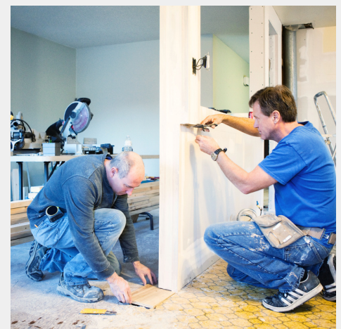
Journey to Dream received an amazing grant through Connex Foundation for some much-needed renovation at Kyle's Place.