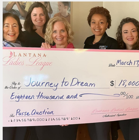
Lantana Ladies League raised $18,000 for Journey to Dream with their Purse Auction