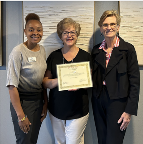
Journey to Dream and Kyle's Place received the Gift of the Hearts Award from the Highland Village Women's Club.