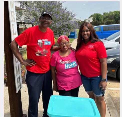
Hangin' with Herb organized a collection of hygiene and cleaning products while on one of their group walks, which was truly remarkable.