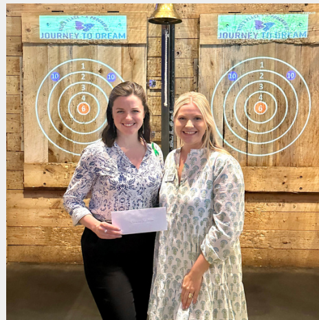
Corky's Gaming Bistro in Grapevine hosted JTD for an give-back event donating 25% of all food sales. Corky's surprised us by matching that donation at the end of the night!