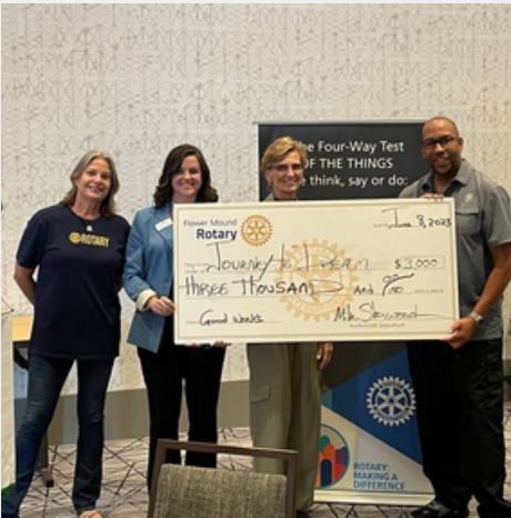
Flower Mound Noon Rotary Club presented Journey to Dream with a $3,000 check, we were one of their grant recipients.