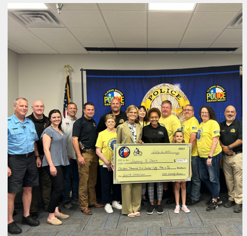
Flower Mound Police Department's Annual Bike with the Blue Event was amazing and raised a little over $13,950 for Journey to Dream & Kyle's Place.